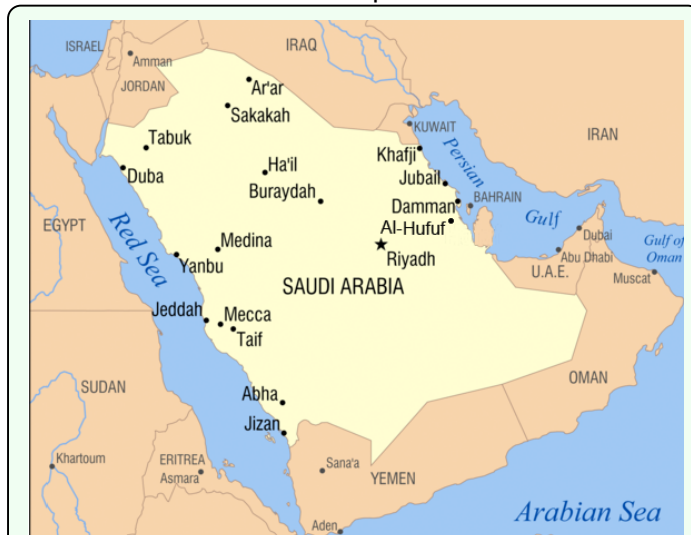
Figure 1. Map of Saudi Arabia showing Al-Hufuf, the capital of Al-Ahsaa district. High quality figures are available online.